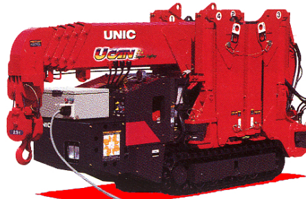
w295CMRS Gasoline and Electric